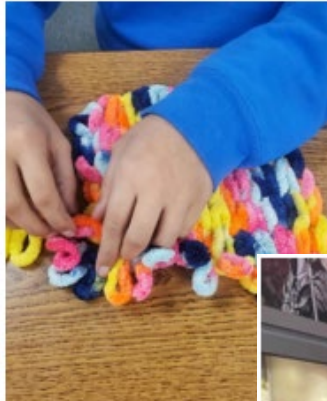
National 4-H Conference