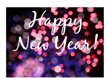
Happy Holidays to all.

We hope everyone has a great Christmas and Happy New Year.